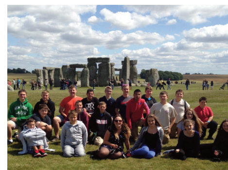
Troop 29 in front of Stonehenge in Wiltshire, England