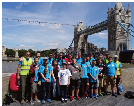
Troop 29 in front of the Tower Bridge in London, England

by Harry J Buttito Jr, Unit Commissioner